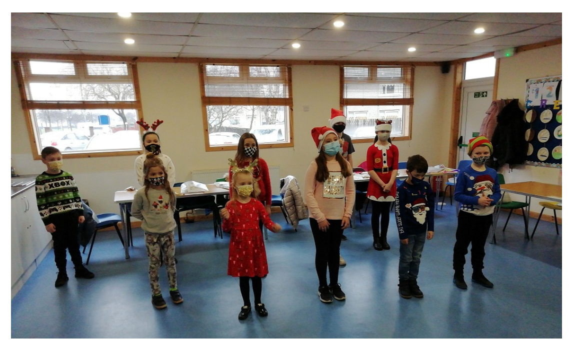
The children learning to sign 'Merry Christmas Everyone' for their Nativity in December